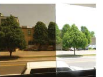
Bronze Solar Cool Tint