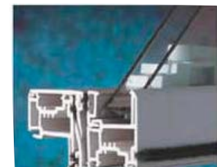
Triple Weatherstripped. More weatherstripping means less air leaks.

Our beefy triple weatherstrip on the sash reduces air infiltration. Our Ultra Sonic Welded fibers on the weather-strip keep cold out longer. Reinforced shoulders on base of weatherstrip help keep fibers straight to keep the cold out. Interlocking sashes reduce air infiltration and add security. Pocket sills add 90 degree angles which cuts air infiltration.