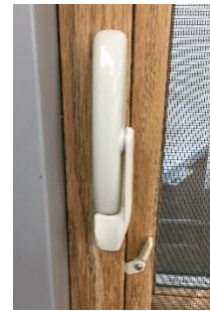
DOWN TO LOCK