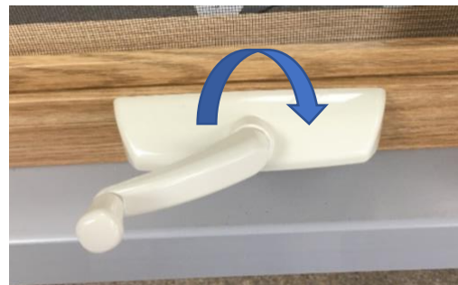
TURN RIGHT TO CLOSE